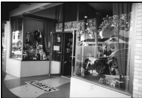
2007 Awardee: The Wishing Well Toy Shop at 6723 Greenleaf Avenue for Commercial Interior

P. O. Box 9114 Whittier, CA 90608 www.whittierconservancy.org