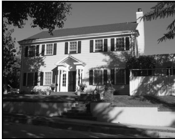
[Residence on Haviland Avenue]