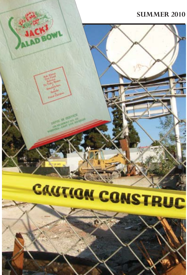
The demolition of Jack's Salad Bowl, 11533 Whittier Blvd., was done with no CEQA/Historic Resources Commission review.

In accordance with accepted preservation practice, all buildings over fifty years old must be checked for historic significance before they can be demolished or drastically altered. The "fifty-year rule" is the gold standard in cities with protective ordinances. THIS DOES NOT MEAN THAT EVERYTHING FIFTY YEARS OLD IS HISTORIC; MOST ARE NOT. What it does mean is that all buildings over fifty must be checked against an inventory or list of historic resources to make sure that nothing significant is lost.