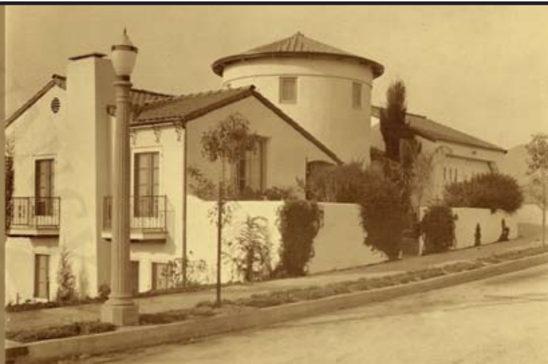
THE STODDY ESTATE, COLLEGE HILLS HISTORIC DISTRICT, BUILT IN 1926