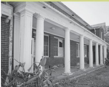
The Classic Tuscan Columns at Nelles