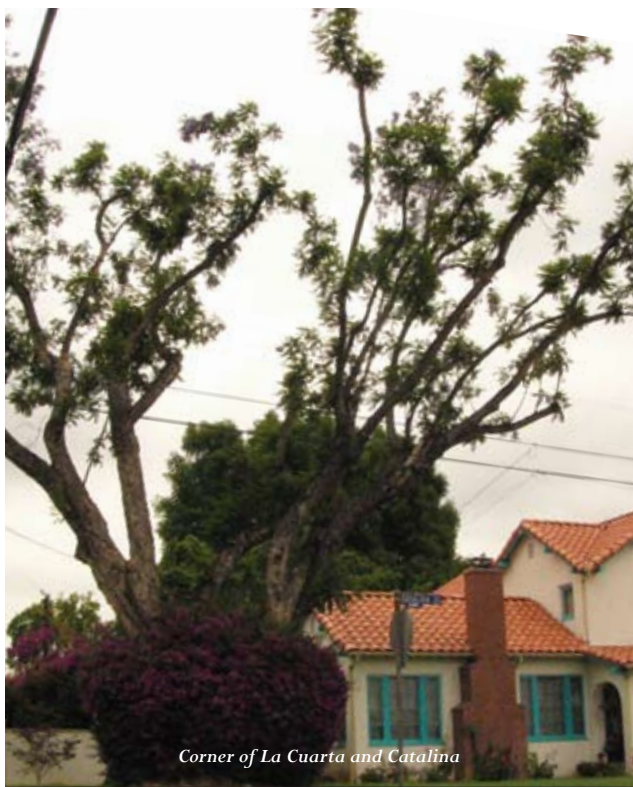
Corner of La Cuarta and Catalina

The 75 year old jacaranda surrounded by bougainvillea at the corner of La Cuarta and Catalina is a familiar feature of central East Whittier. It is cherished by those who live there, those who used to live there, and by neighbors galore.