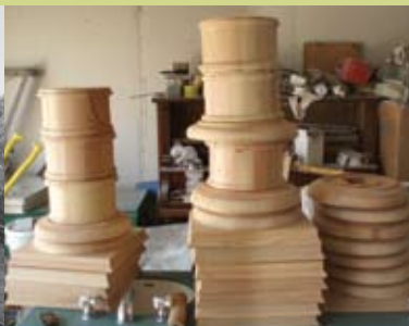
Beautifully crafted replacement pieces for the Palm Station Project

The Conservancy, in collaboration with Southern California Edison and the City of Whittier, will break ground soon for the Greenway Trail Palm Park Station. The station celebrates Whittier's prominent architectural styles and features columns from a historical building that once stood on the Fred C. Nelles site. Upon completion, the Conservancy will host a reception, so stay tuned for more information soon! 🎉