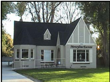
2006 Awardee: Moneyline Escrow for renovation of historic Nixon Home

P. O. Box 9114 Whittier, CA 90608 www.whittierconservancy.org