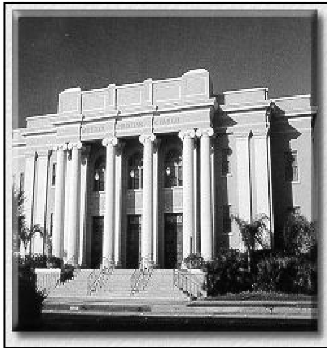
[First Christian Church, Whittier]

By popular demand, this year we will be repeating a Holiday Candlelight Walk theme from several years ago by visiting historic uptown churches. On Monday, December 11th, we will meet at 7:00 P.M. on the Bailey Street side of Central Park. We will walk to six nearby churches where we will enjoy the architecture, spend a few minutes inside of several, and might just be lucky enough to hear some beautiful music along the way. We will wind up with refreshments. Dress for the weather and wear comfortable shoes. There is no charge for this event. Happy holidays to all!