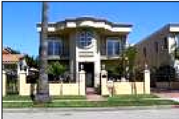
Example of incompatible new construction both in scale and form

in Friendly Hills and East Whittier, signs of mansionization are emerging. The tear down of older ranch style homes and in their place, the construction of oversized, Mediterranean behemoths, may negatively impact the neighborhood.